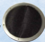
Odor Absorbing Media Filter