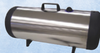
Available with or without hose

Call or email Airstar for pricing and to place your order.